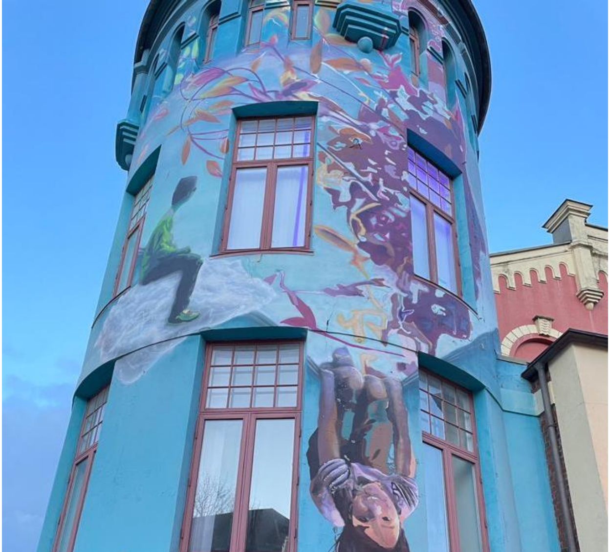
KNUDEN cultural school of Kristiansand